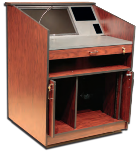
ADL 38M Multimedia Lectern Overall Dimensions: 38"w x 23" d x 48" h

ADL 36MM Multimedia Lectern Overall Dimensions: 36"w x 32" d x 48" h